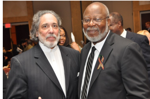
Research Project, Nine Academics gathered at Gammon Seminary